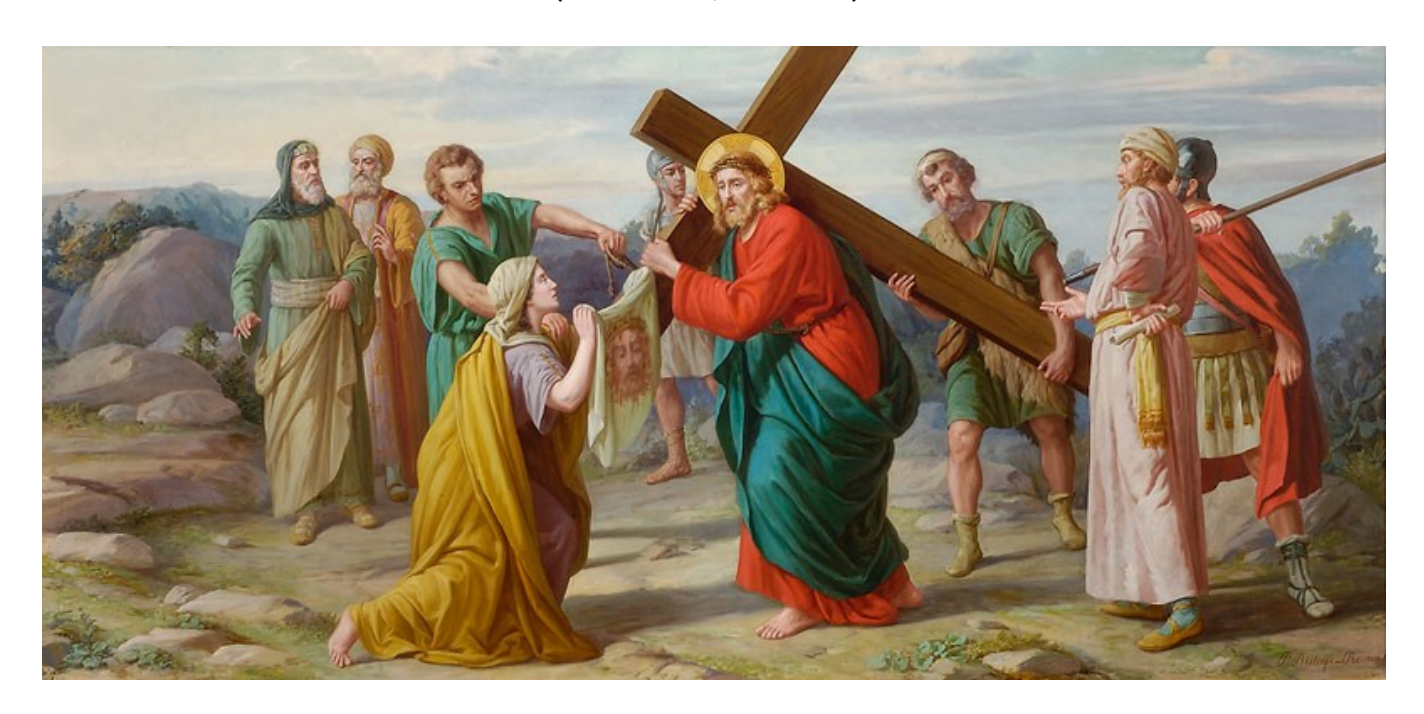
V. We adore Thee, O Christ, and we praise Thee. R. Because by Thy holy cross Thou hast redeemed the world.

Veronica Wipes the Face of Jesus (Isaias 52:14, John 14:9)