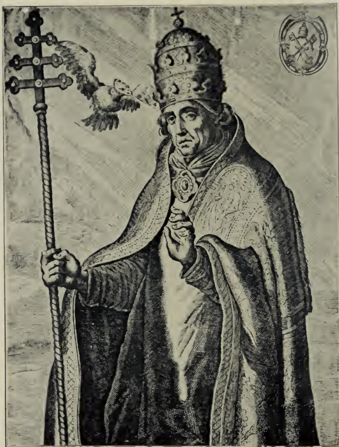
Saint Gregory the Great.